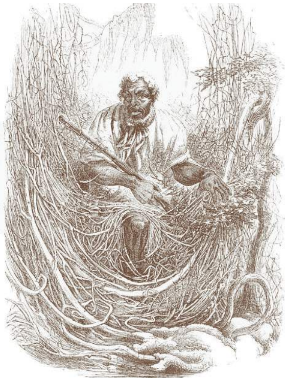
Harper's Magazine, 1856