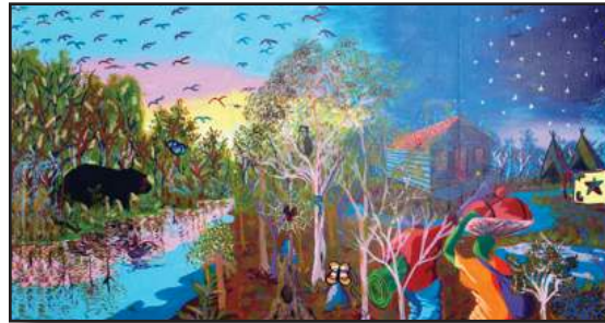
Artwork credits: Underground Railroad Mural by Trigg Community School Students and Tunde Afolayan Famous. Canal #1 is part of the Underground Railroad Series: PASSAGE: Echoes of the Great Dismal Swamp .

The Dismal Swamp Canal, Dismal Swamp State Park, Great Dismal Swamp National Wildlife Refuge, and the Dismal Swamp Canal Welcome Center share recognition as designated sites and members of the National Underground Railroad Network to Freedom Program. This Program commemorates and preserves the historical significance of the Underground Railroad in the eradication of slavery and the evolution of our national civil rights movement. Free Network to Freedom Passports and cancellation stamps are available at these designated locations.